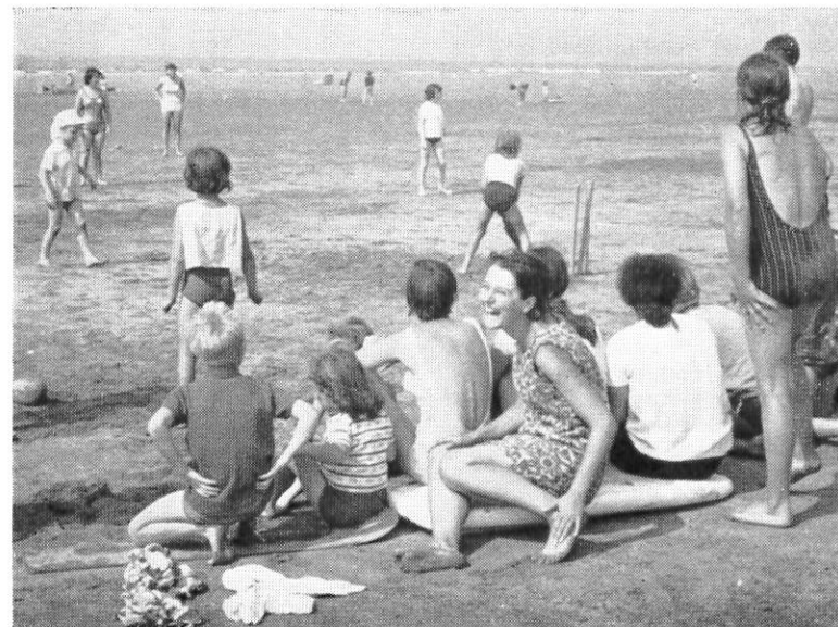
Our innings next