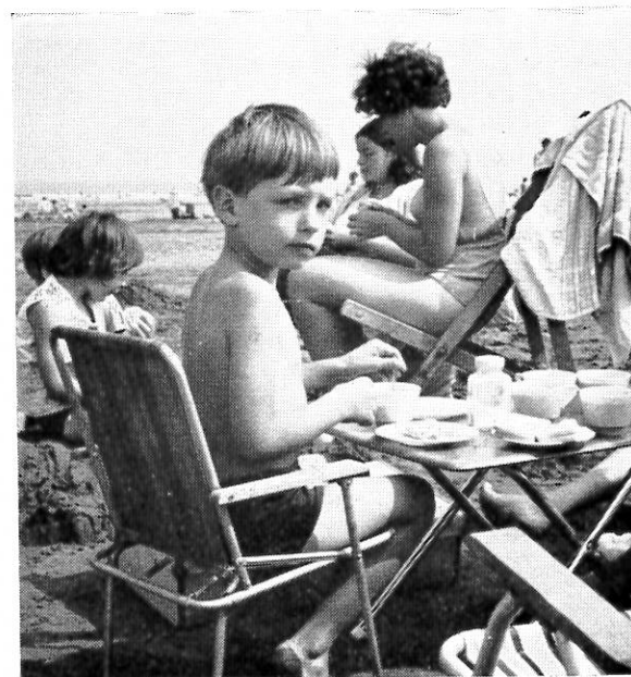
"I'm well catered for"