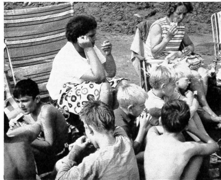
Eating is a serious business