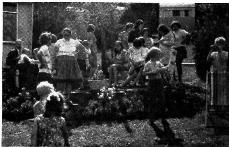
At the Sunray Caravan Gardens