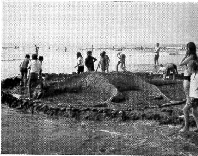
The Westward Ho! Monster