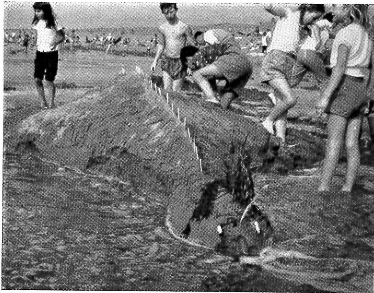
About to swim away