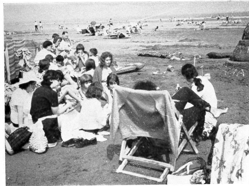
There's plenty of room for us on this beach