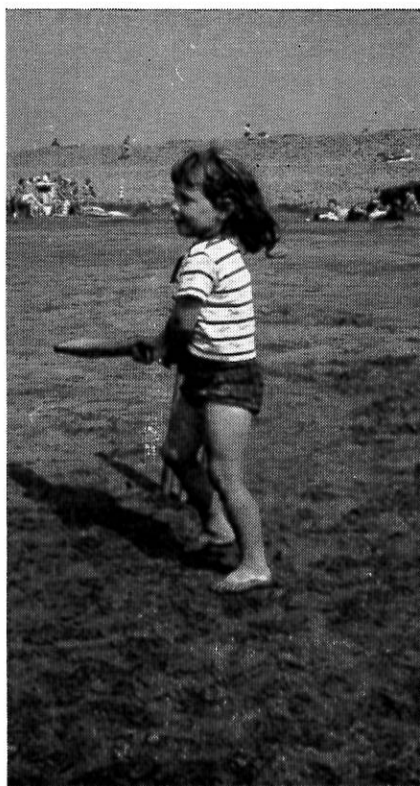
A future cricketer?