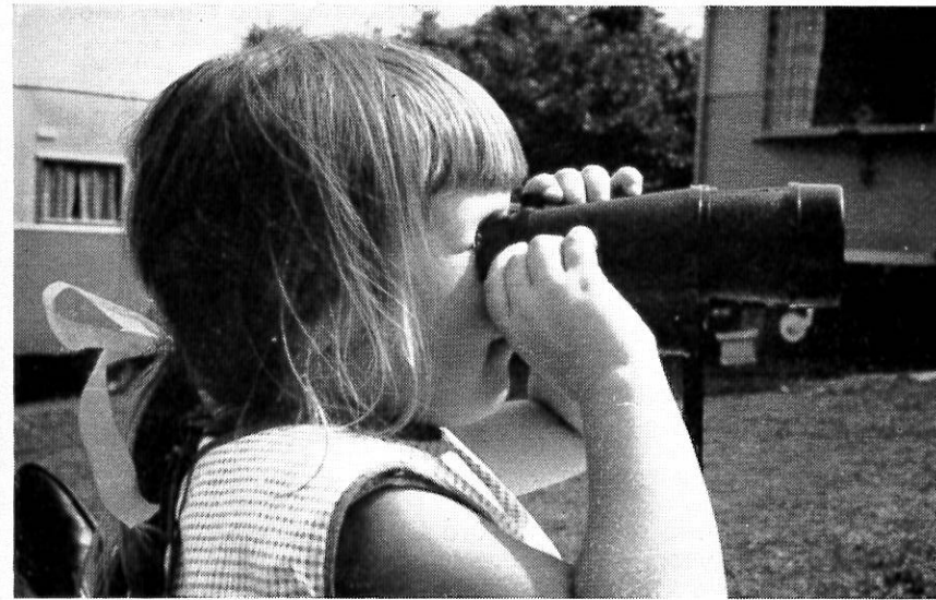
"Oh yes, I see"