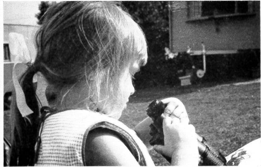
"What's it for?"