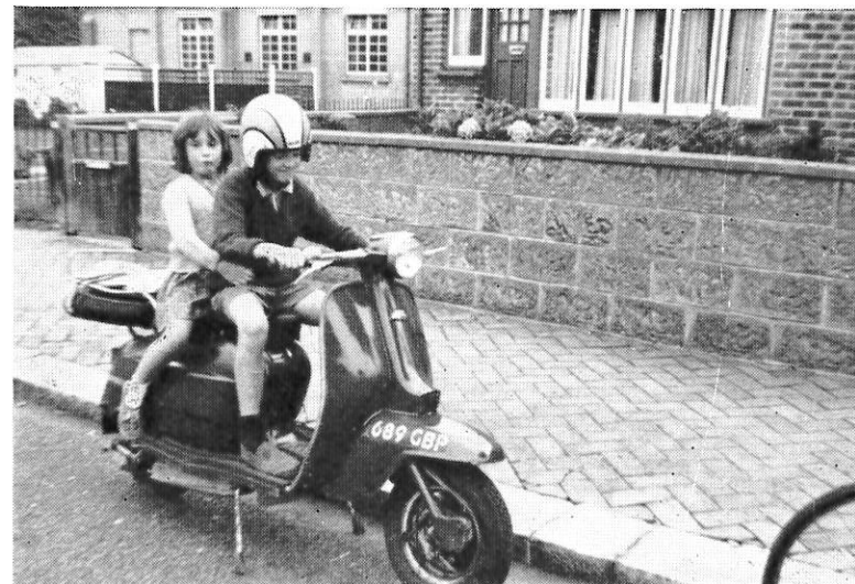
"If only we could start the engine!"

"How good is the God we adore, Our faithful, unchangeable Friend, Whose love is as great as His power And knows neither measure nor end. 'Tis Jesus, the first and the last, Whose spirit will guide us safe home, We praise Him for all that is past And trust Him for all that's to come.