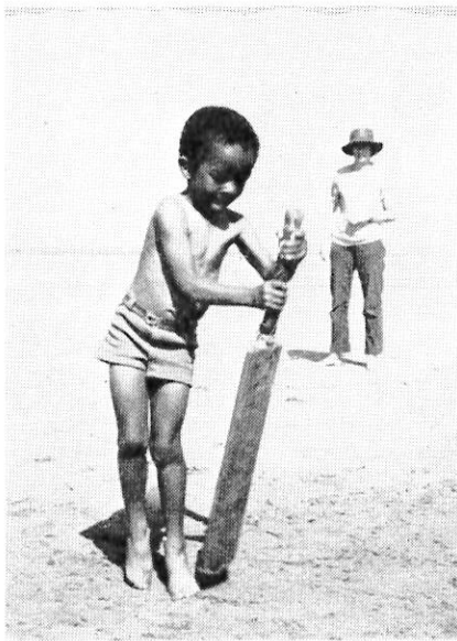
On the beach.

Our very sincere THANKS to the many friends who sent lovely Harvest and Christmas gifts for the Family.