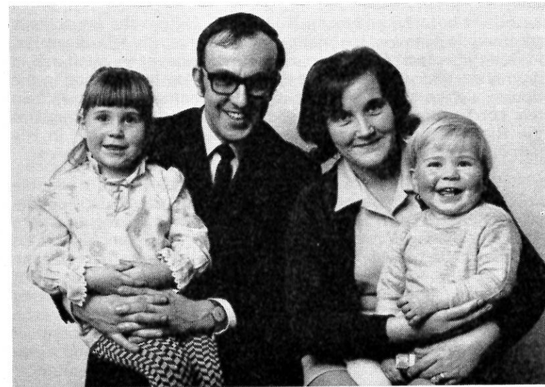
One of our 'daughters' and her family who live close to us. We see a lot of each other and are grateful for practical help always readily given.