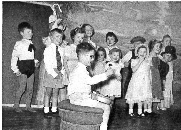
"He put in Thumb and pulled out a Plum"