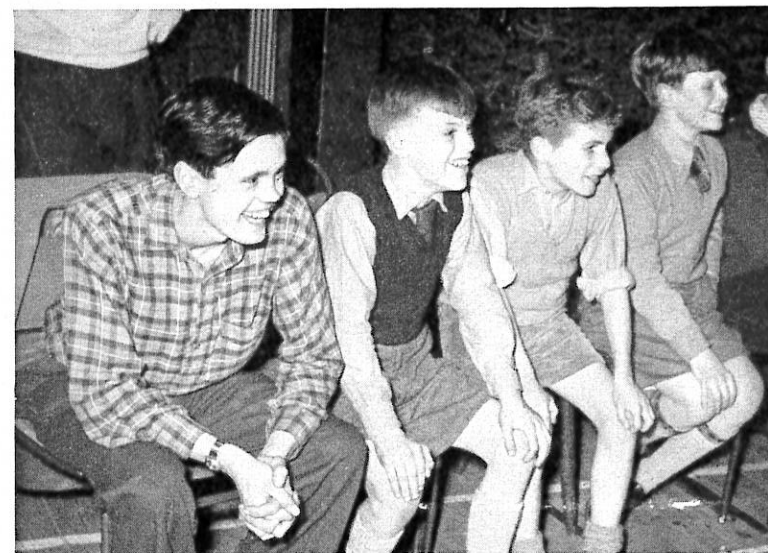
Enjoying the Fun