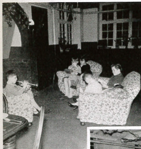
The Day After Christmas