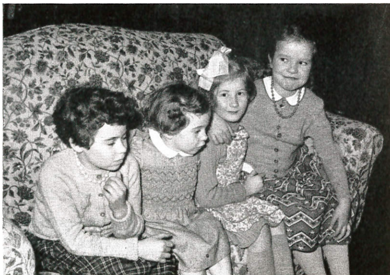
Sharing the Fireside