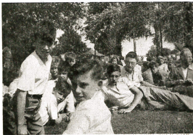
A Day at Maldon.

O God, we thank Thee for every boy and girl, for every grown-up person in this Church tonight who has the Lord Jesus living in their hearts, bless them, use them and grant to us all increasingly a surrendered heart that shall enable Thy Will to be done through us. Then, Lord, we feel there may be some who have never asked Jesus in. O God, bless them tonight, and even while we close our eyes and pray to Thee may someone, some boy, some girl may be, say that little prayer: "Into my heart, into my heart, come into my heart, Lord Jesus, come in today, come in to stay, come into my heart, Lord Jesus," and to Thee shall be all the glory now and through all Eternity. Amen.