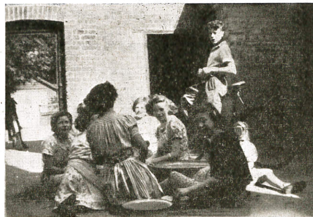
Peas for Dinner.