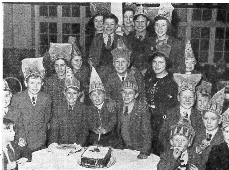
Enjoying a party by the Walthamstow Round Table.