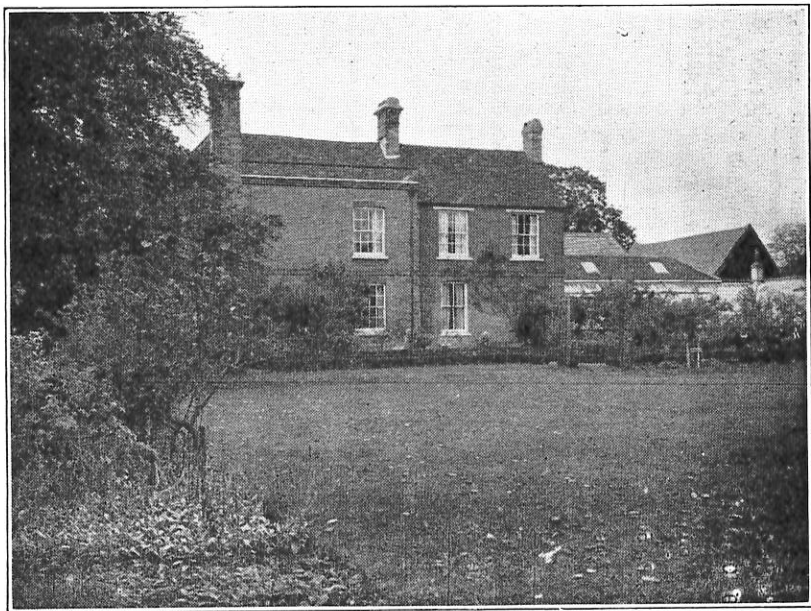
The Grove—South-East View.