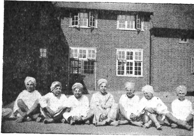
"Our Boys and Girls who presented a Missionary Play."