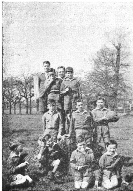
"A Happy Group."

31st. St. Albans, parcel secondhand shoes, etc.