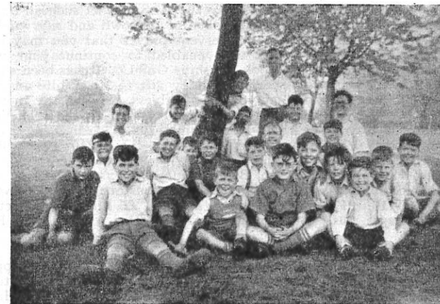
"A Day's Outing with the Boys."

2nd. Lansdowne Baptist Church, Bournemouth, £11 2s. 10d.