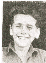
"Some of our older children attending the Secondary Modern School in Woodford."