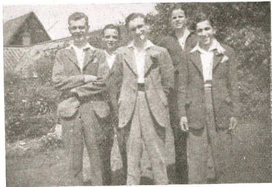
"At Tiptree—ready for a game of croquet."