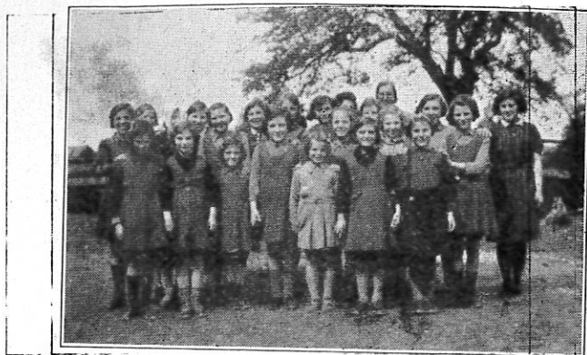
IN THE PLAYING FIELD