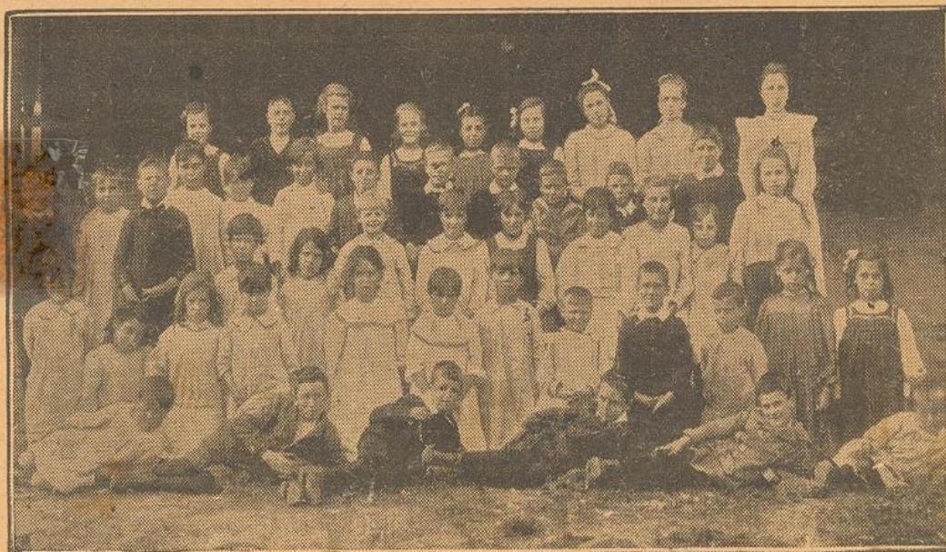
Group of the Boys and Girls at the Home for Destitute and Motherless Children.