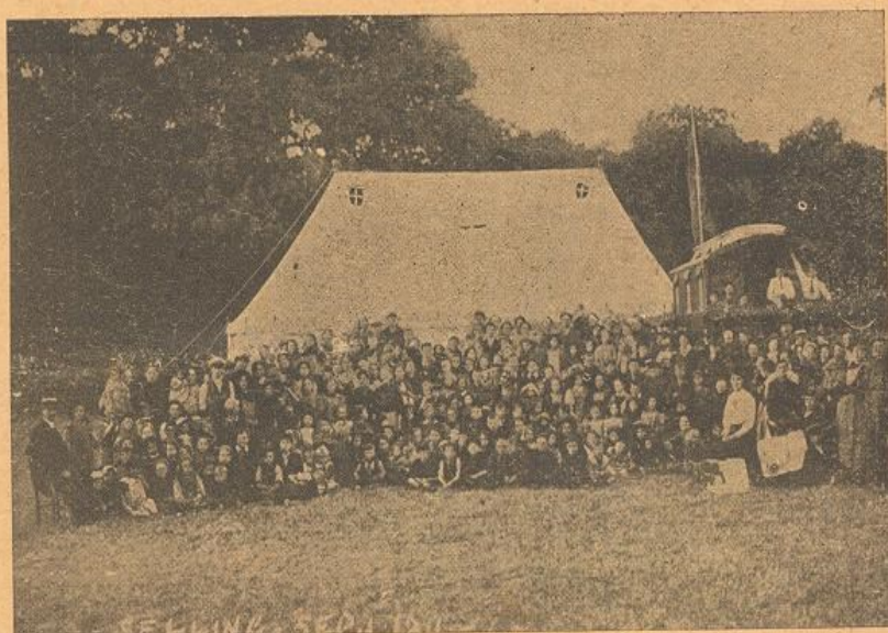
The Gospel Car and Tent in the "Hopfields," Selling, Kent.